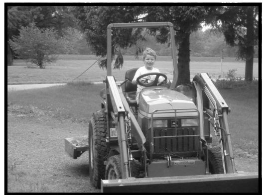
Caleb likes to drive the tractor